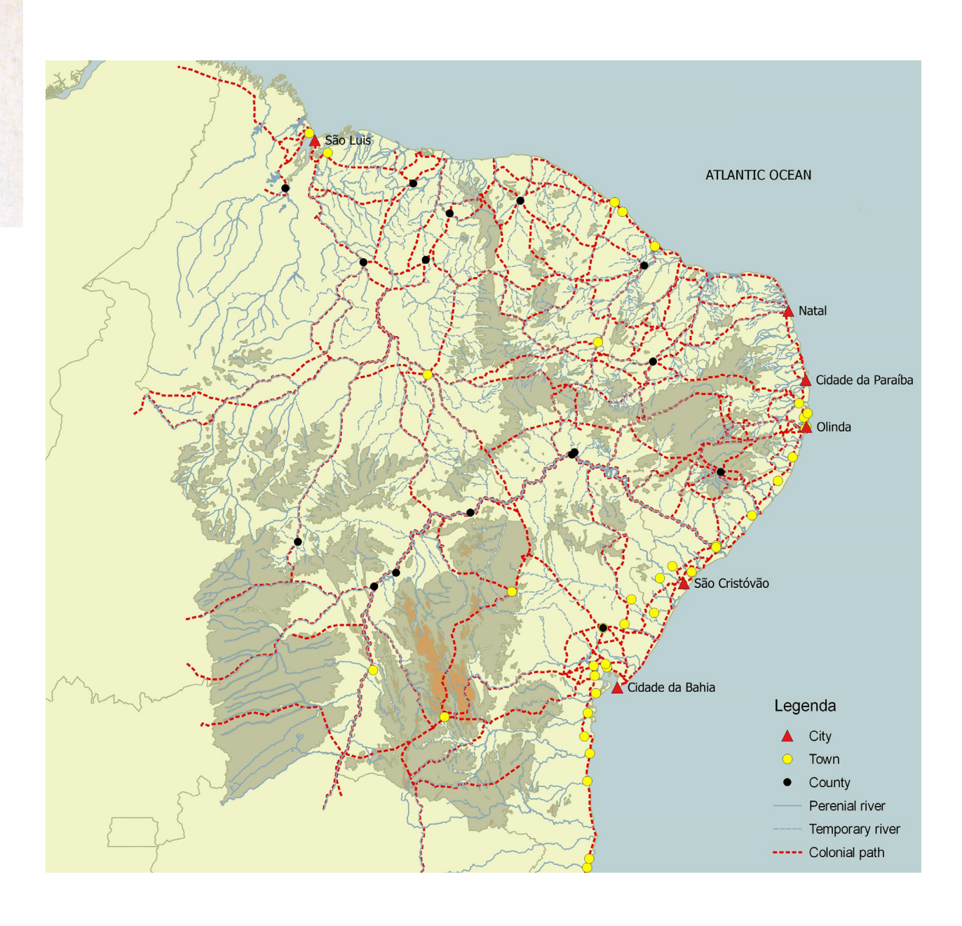
Figure 1 - Network of settlements of the captaincies of the North in 1750. Created by the author through a georeferencing program (Quantum GIS) on cartographic basis of the Brazilian Institute of Geography and Statistics (IBGE).