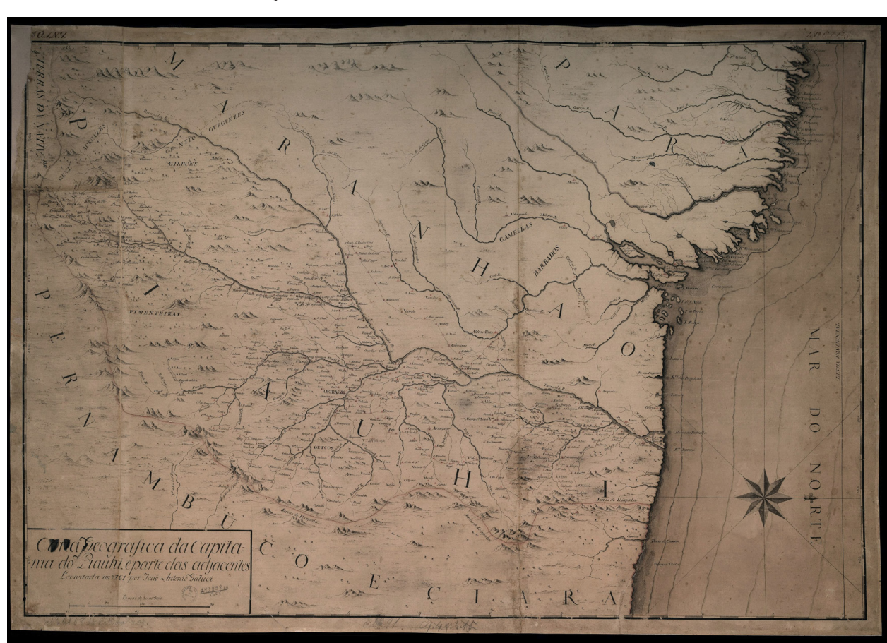
Figure 2 - GALUZZI, Henrique Antonio. Geographical Charter of the Captaincy of Piauhi, and part of the adjacent areas. Map available at www.bn.br. Accessed on: 30 mar. 2010.

of the paths and making repeated observations of latitude and longitude that was possible for me...". (AHU_ACL_CU_PIAUÍ, Cx. 7, d. 437). The Carta Geographica da Capitania do Piauhi, e partes adjacentes was the material and graphic result of the cartographic survey expedition. (Figure 2) The engineer was interested in drawing the territory's material and social specificities, punctuating the hierarchies of human settlements, the roads traversed and the indigenous ethnic groups that had not yet been reduced in religious missions or Indian villages. He also situated the orographic and hydrographic system of the region, basic content for the delimitation of terms and jurisdictions of future towns. The case of Piauí is emblematic, in particular concerning the spatial reorganization promoted by the enlightened policy of Sebastião José de Carvalho e Melo and his half-brother, Francisco Xavier de Mendonça Furtado.