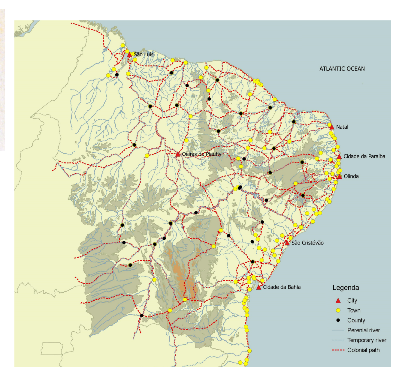
Figure 3 – Network of villages and captaincy towns in the North in 1820. Author's design through georeferencing program (Quantum GIS) on cartographic basis of the Brazilian Institute of Geography and Statistics (IBGE).